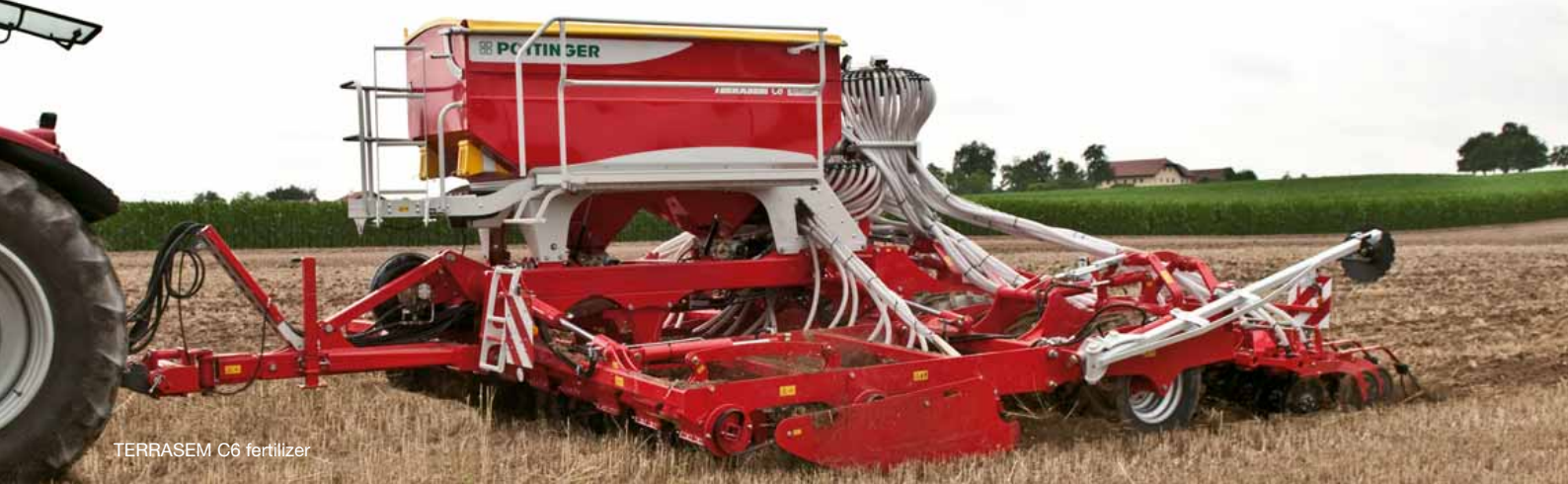
TERRASEM C6 fertilizer