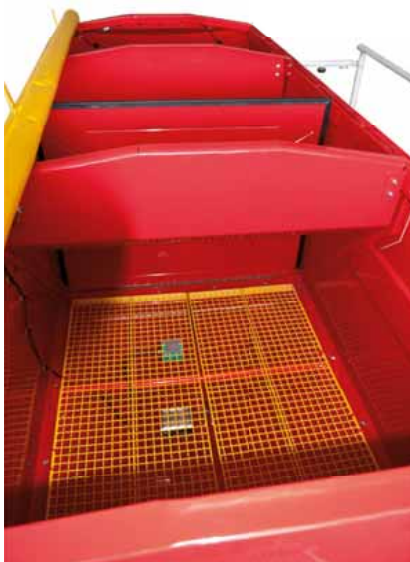
2-section seed hopper

Pöttinger fully supports the trend in direct fertilisation: in the face of increasing fertilizer prices, new types of fertilizer, new fertilizer regulations and environmental legislation, it pays to employ precision fertilizer management in future. With direct fertilisation Pöttinger TERRASEM mulch seed drills offer the right process for a wide range of individual needs and operating conditions.