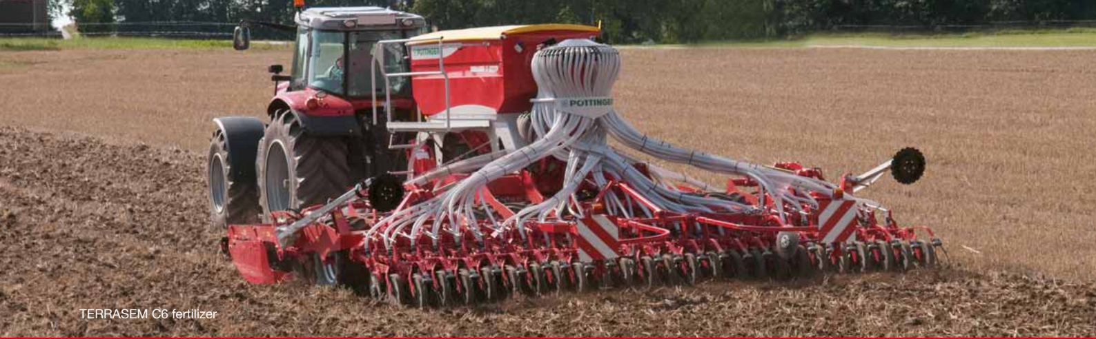
TERRASEM C6 fertilizer